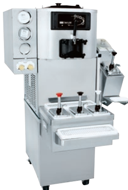
Optional Cart with rear door for front mount syrup rail