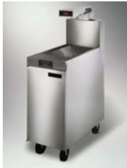
FDS-100 with optional heat lamp.