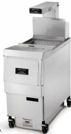
Fryer dump station model FDS-200 shown with optional overhead heat lamp.